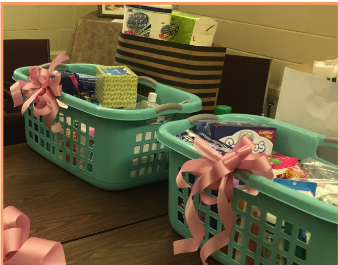
Baskets prepared by Hearts in Motion for McShin Ladies.

Also, thank you so much for all the donations made to the McShin Ladies houses – we filled a large laundry basket with toiletry items and a large bag of paper products for each of the four houses.