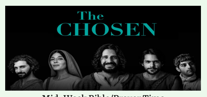
Mid-Week Bible/Prayer Time BIBLE STUDY IS SUSPENDED FOR THE SUMMER